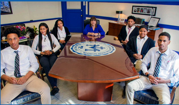
The Health Occupations Team / Trinitas Program